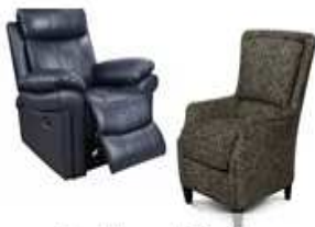
Recliners / Chairs